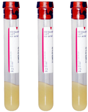
3 SST Tubes