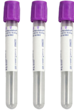
3 LAV Tubes